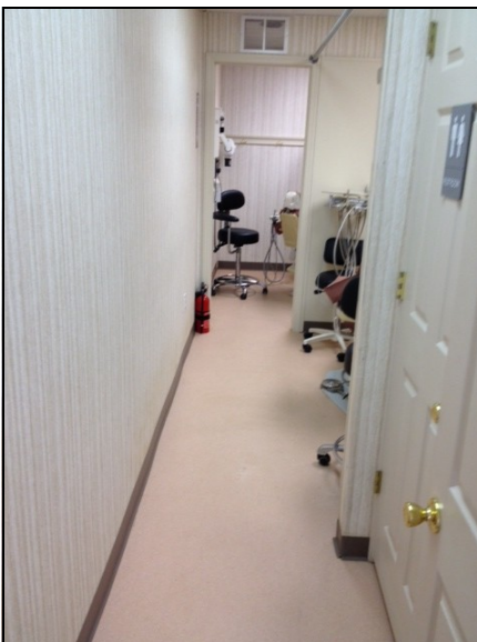
Each Dental Suite offers privacy for the patient to minimize stress.