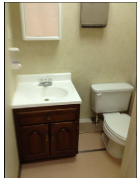
This coach offers two lavatories for maximum patient and staff comfort.