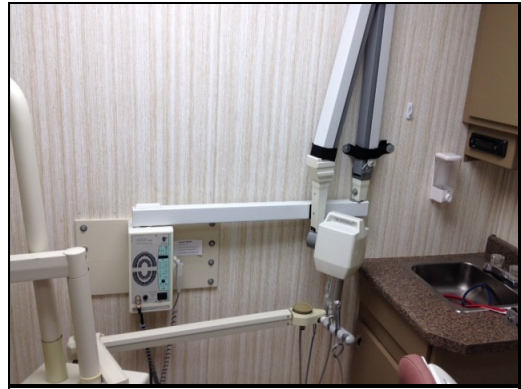
An Analog Inter-Oral X-ray is provided in each Dental Suite so patient never moves increasing throughput.