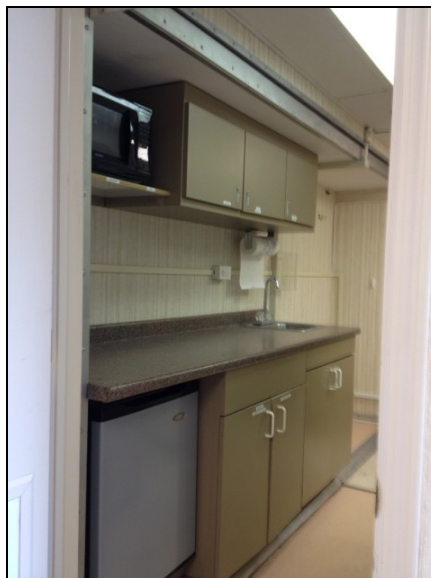
A Tech Convenience Center is available as well as Processor and Autoclave (not shown) located convenient to all Dental Suites.