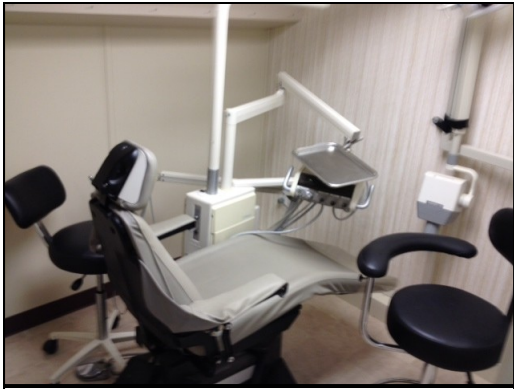
A doctor's and assistant's chair is provided in each Dental Suite to make each Dental Suite complete.