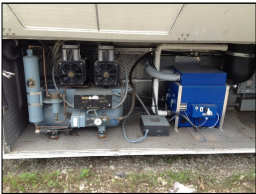
A high quality Dental Compressor and Suction Unit is provided to deliver quality air and suction to eliminate "Do Overs".